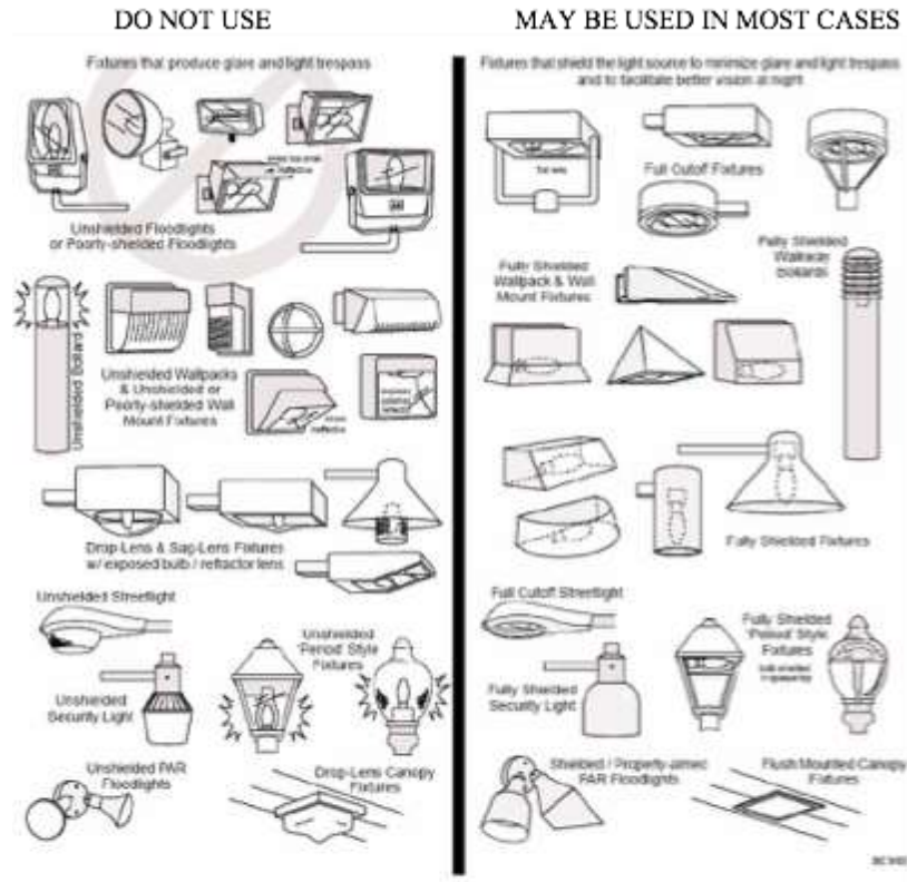
The lights on the left are non-conforming. Those on the right can be used in most cases. Depending on the mounting height and proximity to the property line, additional shielding may be necessary to prevent the luminous elements from being visible from any other property.

Dark sky shield: anything that is used to shield a light fixture so that it behaves as a fully shielded fixture. These include but are not limited to, for example, fixtures outfitted with caps or housings or installed under canopies, building overhangs, roof eaves or shielded by other structures, objects or devices.