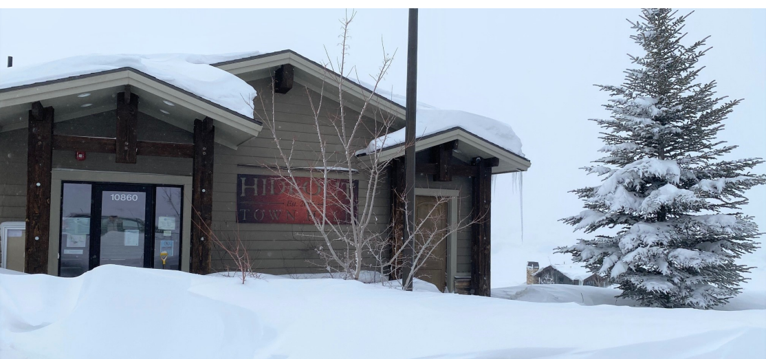
Town Hall snowed in—February 22nd