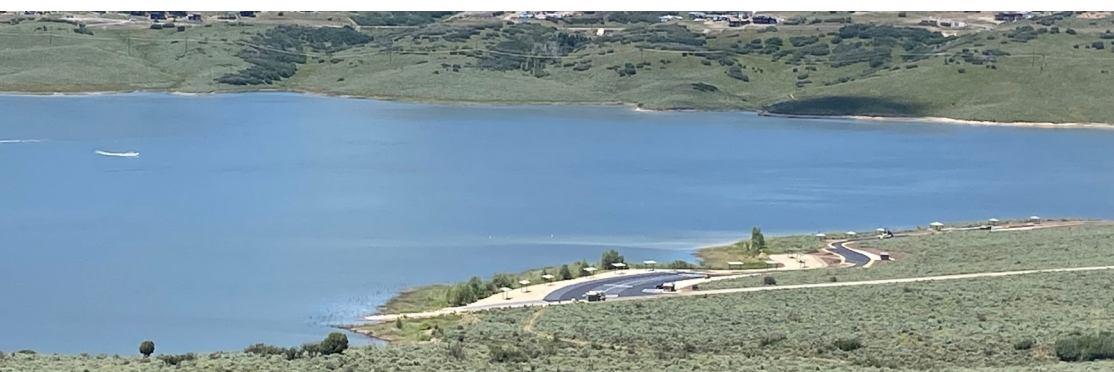
Progress on Improvements in Ross Creek Recreation Area at Jordanelle State Park

Many Hideout residents can see from their views to the Jordanelle that Ross Creek Day Use Recreation Area construction is progressing! The project will include a new sand beach, restrooms, cabanas, and entrance station. The expected opening date has not been announced yet, but is anticipated to be in time to enjoy the area this season!