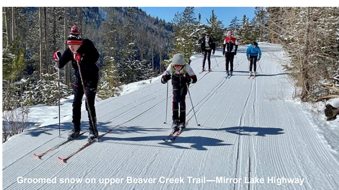
Groomed snow on upper Beaver Creek Trail—Mirror Lake Highway