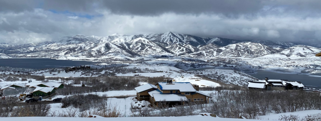
March 13, 2024 Looking Down on New Rooftops in Golden Eagle