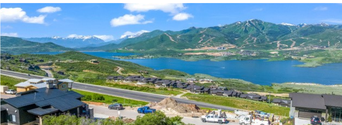
A View from Soaring Hawk...now the site of 21 active building permits