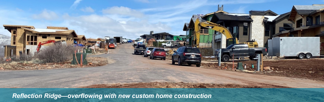
Reflection Ridge—overflowing with new custom home construction